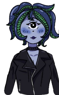
Figure 3. Character in the novel

After going through a process of refining the story and having significant changes after the review of our advisor, it was decided to change the owner where the story took place, changing the race of our characters, changing them from being human to becoming demons with a more varied form than what we are used to (figure3).