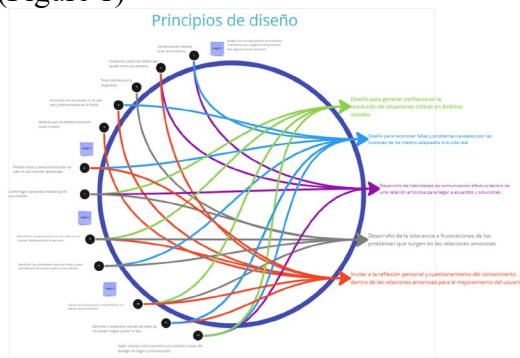
Figure 1. Outline of Design Principles